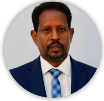
H.E. Abdirahman Omar Osman