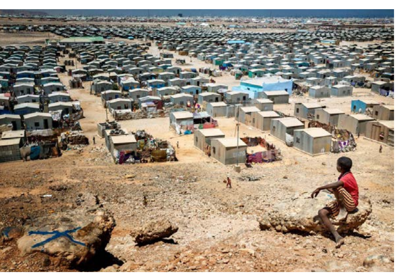
Boy overlooking settlement in Somalia.